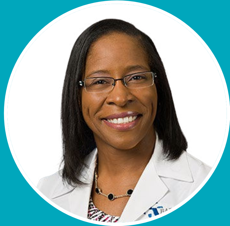
Neurologist Baptist Health