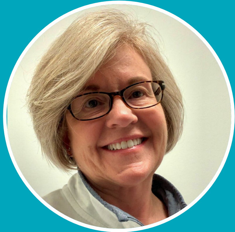
Vice President, Programs Can Do MS